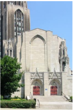
The Stephen Foster Memorial